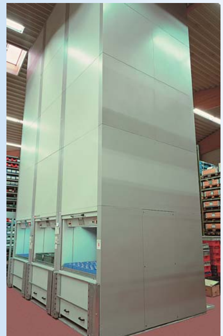
Automatic high racking system for storage of thousands of parts