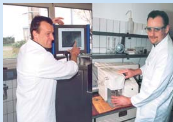
Our team in the pilot plant laboratory