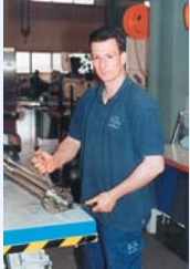
Our service team at IKA®

Our service management team is comprised of experienced mechanical engineers, electronics engineers, chemists, chemical engineers and technicians